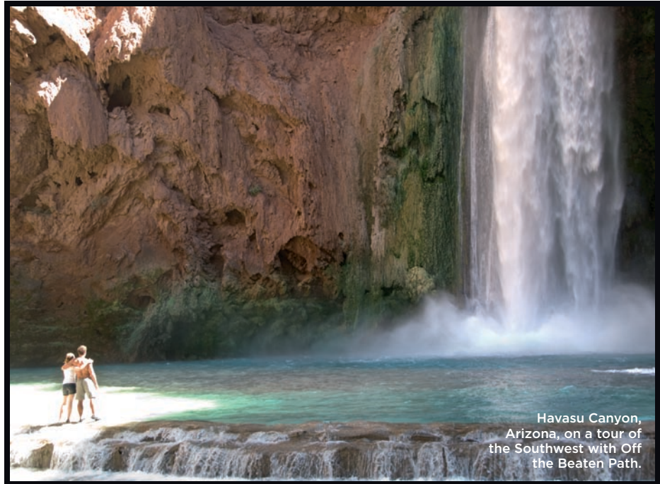
Havasu Canyon, Arizona, on a tour of the Southwest with Off the Beaten Path.

The Operator Elevate Destinations The Highlights Assist in the earthquake recovery by rebuilding a boys' home in Port-au-Prince or a school computer lab in Jacmel. Besides volunteering, you'll visit waterfalls and white-sand beaches, hear musical performances, and meet metalworkers transforming oil drums into sculptures. 617/661-0203; elevatedestinations.com ; March, August, and November;