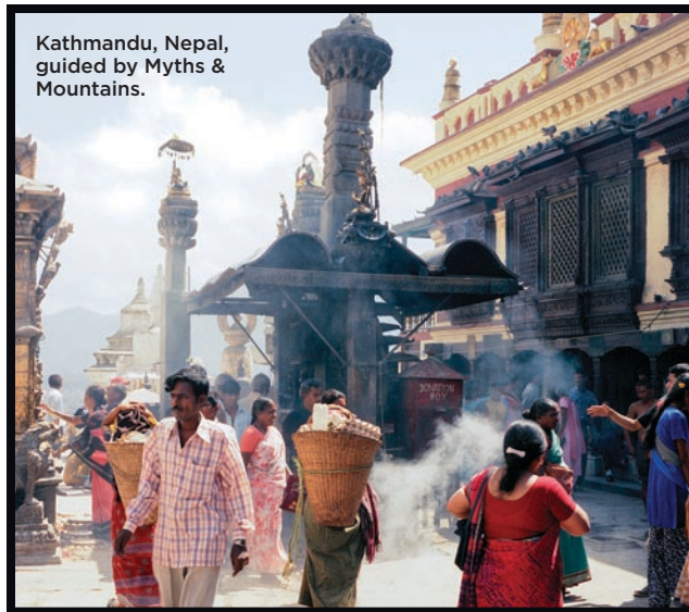
Kathmandu, Nepal, guided by Myths & Mountains.