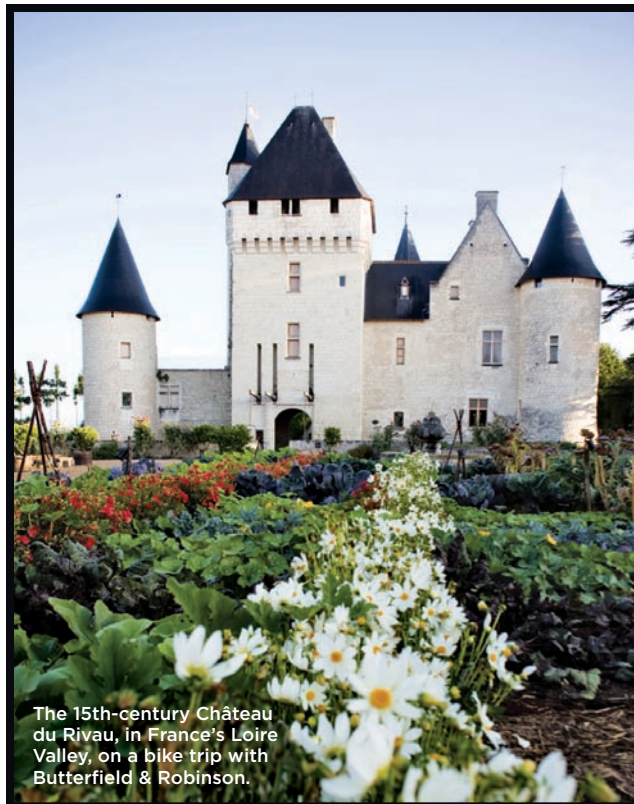
The 15th-century Château du Rivau, in France's Loire Valley, on a bike trip with Butterfield & Robinson.