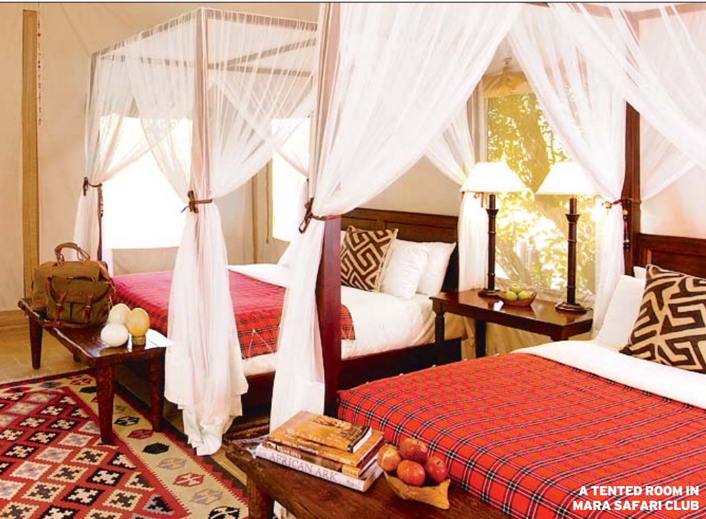
A TENTED ROOM IN MARA SAFARI CLUB