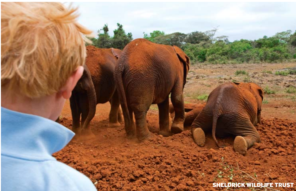
SHELDRIK WILDLIFE TRUST