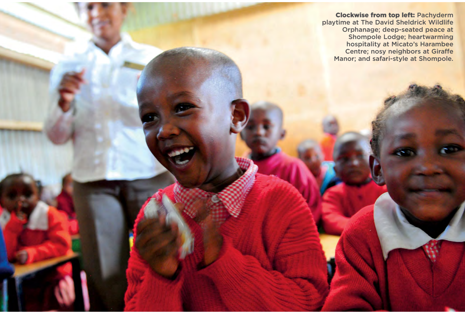
Clockwise from top left: Pachyderm playtime at The David Sheldrick Wildlife Orphanage; deep-seated peace at Shompole Lodge; heartwarming hospitality at Micato's Harambee Centre; nosy neighbors at Giraffe Manor; and safari-style at Shompole.