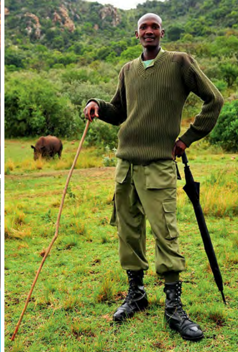
From left: A bird's-eye view at Mount Kenya Safari Club's animal orphanage; high above the Masai Mara in a hot-air balloon (top); poolside at Shompole Lodge (bottom); and a proud caretaker stands before a white rhino near the Mara Safari Club.