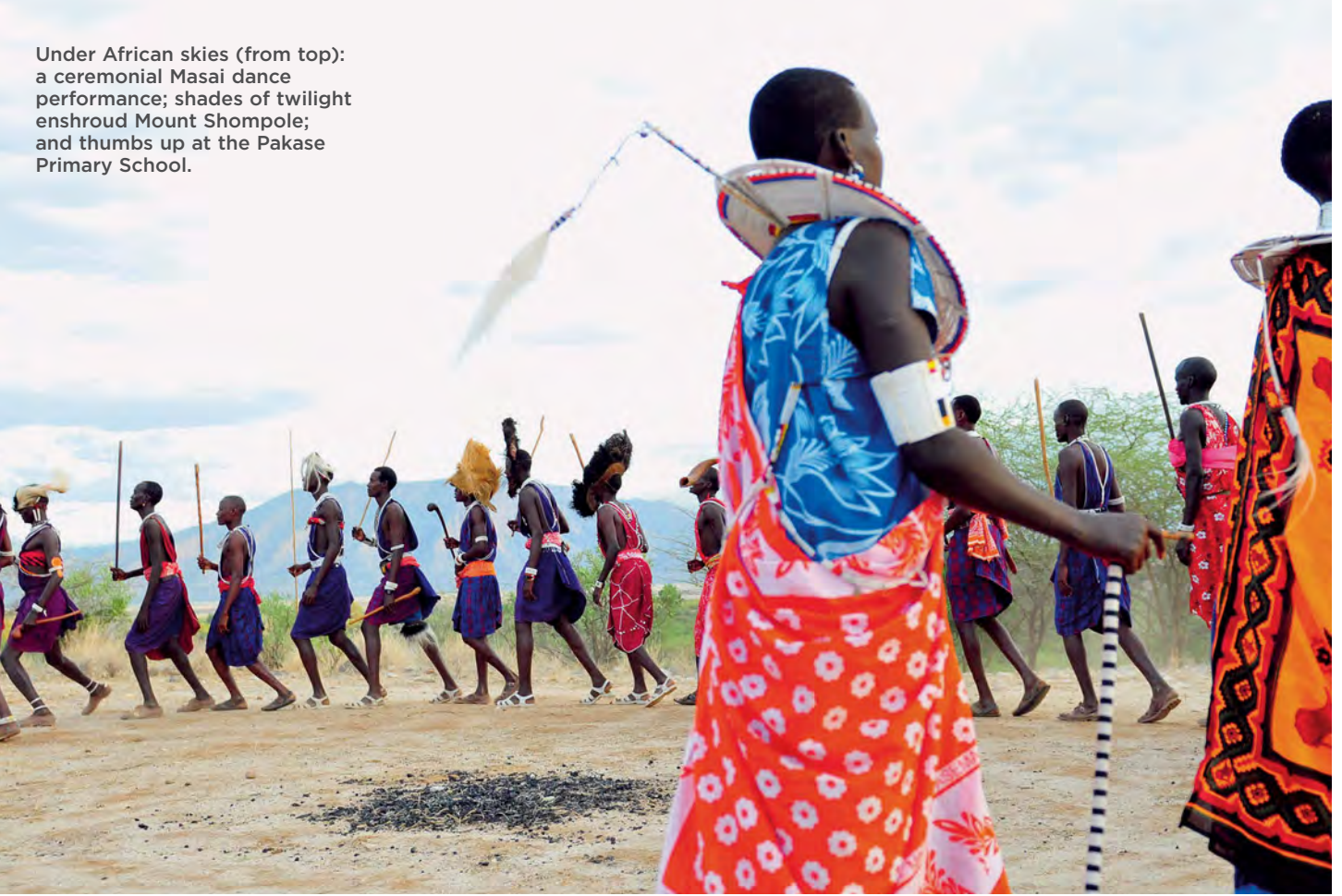
Under African skies (from top): a ceremonial Masai dance performance; shades of twilight enshroud Mount Shompole; and thumbs up at the Pakase Primary School.