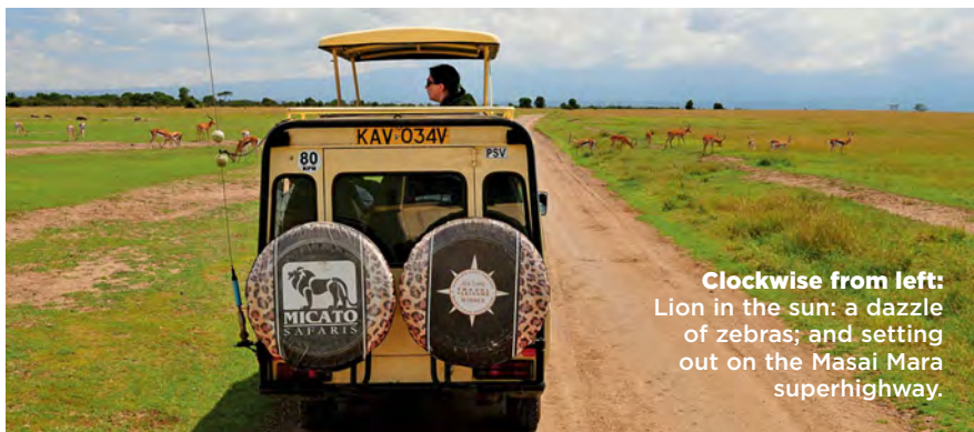
Clockwise from left: Lion in the sun; a dazzle of zebras; and setting out on the Masai Mara superhighway.

Determined to catch up to the cat before sunset, Jeremiah races against time and space as I fathom the enormity of the Mara Game Reserve, a veritable animal planet that covers more than 10,000 square miles when coupled with the contiguous Serengeti to the south. Together, the two parks harbor an estimated 2 million animals that participate in the Great Migration, an annual march in which herbivores commute from Tanzania to Kenya and back again in pursuit of food and water.