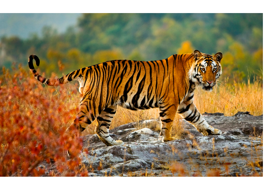
A tiger safari is far from a one-hit wonder. Take one with Micato, the world's top luxury safari specialist.

For Kenya and Tanzania, the one to book is "East African Splendor," a 12-day journey that begins in Nairobi, Kenya and visits the Masai Mara, home to the world's greatest assemblage of free-roaming animals, before heading to Tanzania and the